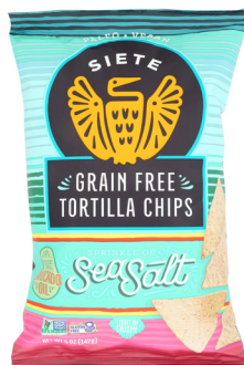
Siete Tortilla Chips selected varieties