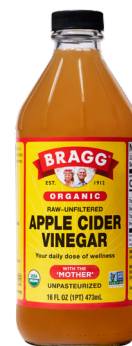
Bragg Organic Apple Cider Vinegar