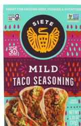
Siete Seasoning selected varieties

Taco Night essentials for the whole familia.